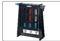
air filter (optional)