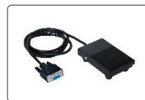
foot switch (optional)