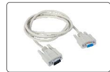
RS232 cable (optional)